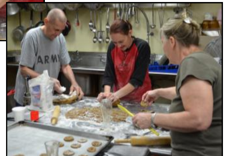
Cookie Café - January 21, 2012