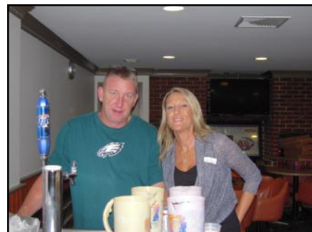
S.A.L. Crab Feast - October 1, 2011