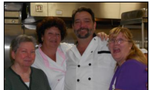
Early Bird Dinner - November 19, 2011