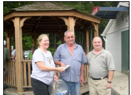
A large turnout of the Legion Family for the Labor Day cookout.