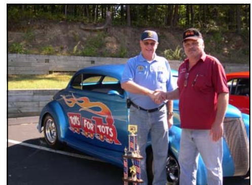
See page 4 for pictures from the S.A.L. Car Show and page 12 for information about this year's Toys for Tots campaign.