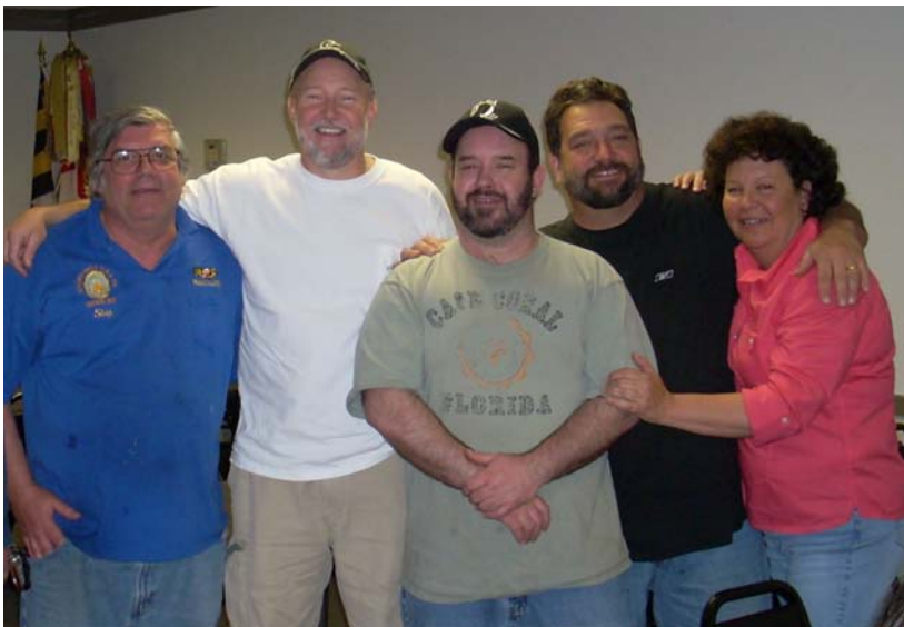
S.A.L. Tuesday Sandwich Night Crew